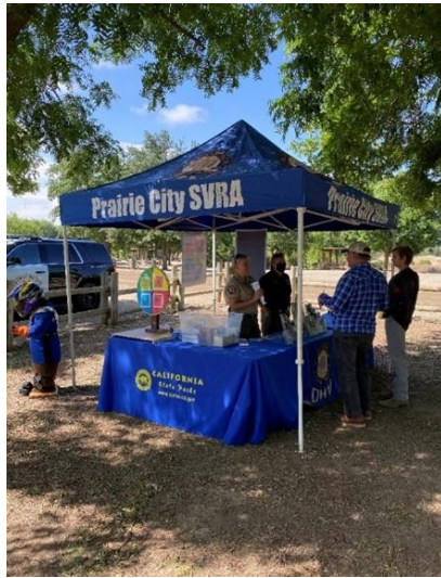
Outreach booth in Main Staging Area