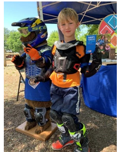
Youth with a dirt bike safety manual next to Prairie Bear